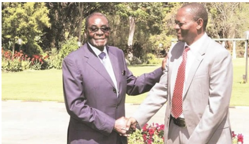
Flashback.....President Mugabe congratulates newly-appointed Rural Development and Preservation of National Cultural Heritage Minister Abednico Ncube soon after the swearing in ceremony at State House in Harare on the 14th of September 2015

The National Archives of Zimbabwe's critical role of preserving the country's cultural heritage must be cherished and respected by all progressive citizens.